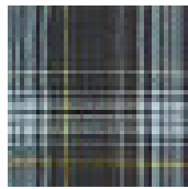
Our Lady of the Lake School Plaid